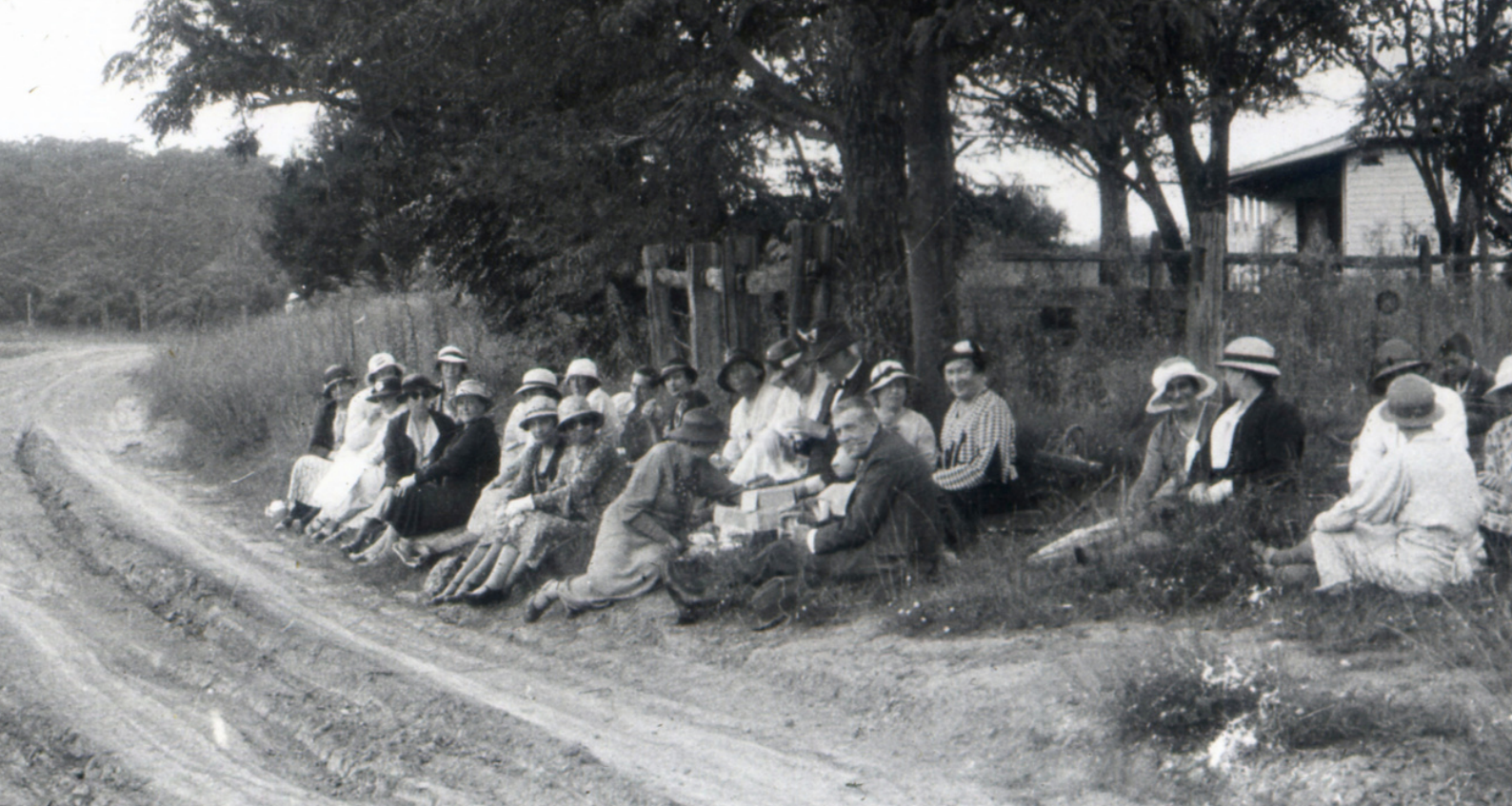
Pilgrim Inn Blaxland, RAHS excursion 1934