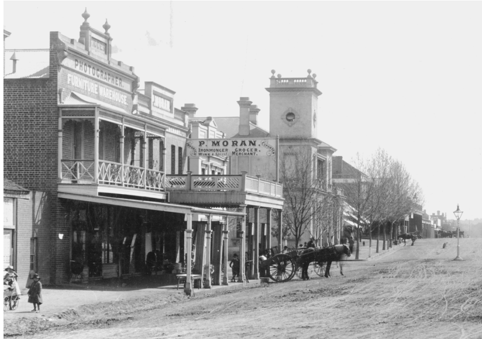
Fitzmaurice Street, c.1890

The City of Wagga Wagga is the perfect location to explore the 2023 Conference Theme – The Way Ahead: Local and Community Histories for our Future . Today the people who call Wagga Wagga home – Wiradyuri people, other First Nations people from across Australia, and non-indigenous people from Australia and around the world – reflect its rich and diverse history. The commitment to remembering and honouring this history both now and for future generations can be seen with the launch of the redeveloped Museum of the Riverina Botanic Gardens site. The museum is dedicated to telling stories about the people and events that helped shape the City of Wagga Wagga and the Riverina Region. This commitment to local and community histories includes an outreach program that supports thirty-eight Riverina museum collections.