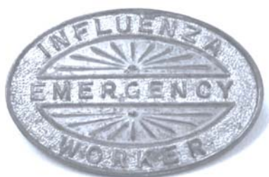
Influenza Emergency Worker badge issued in 1919, held in the Royal Australian Historical Society collection.