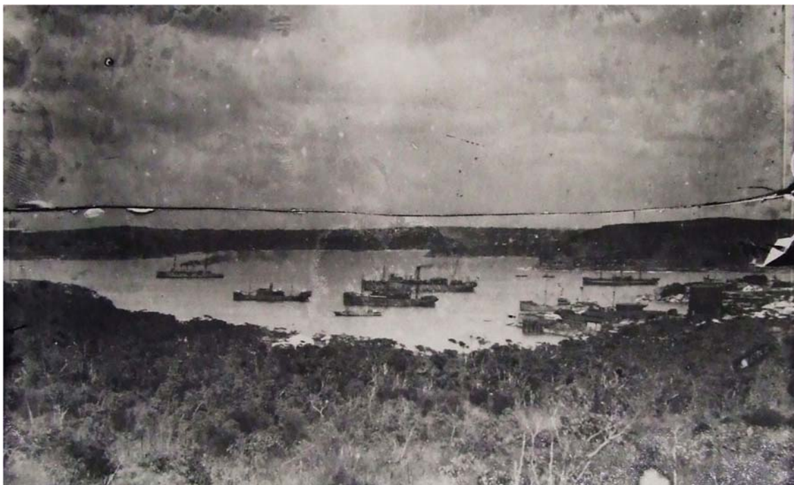
Troopships and coastal vessels moored off North Head Quarantine Station during the 1919 influenza pandemic, National Archives of Australia, Series C1134 Control 2/27.