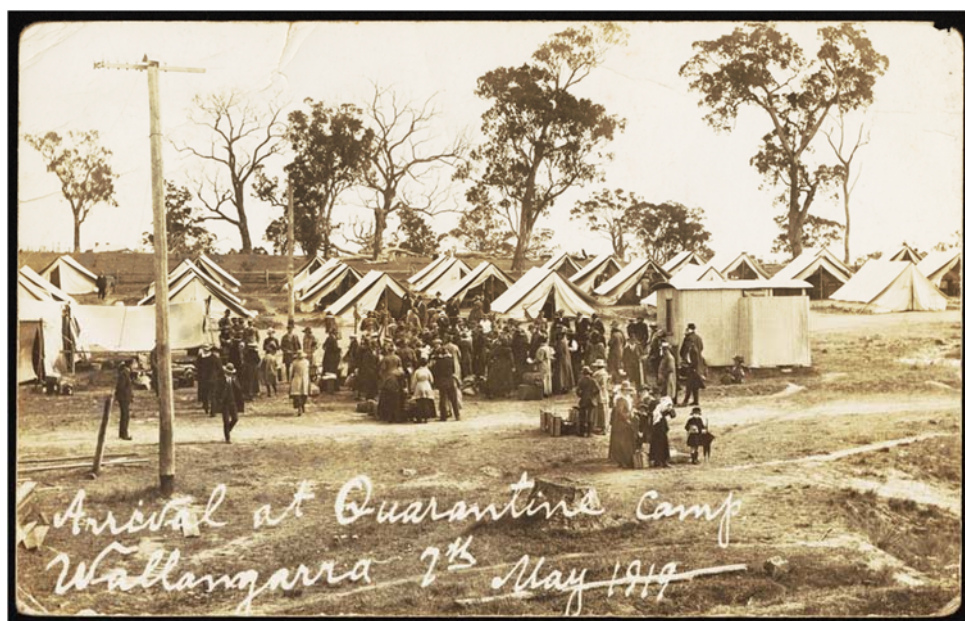
Arrival at quarantine camp, Wallangarra, 7 th May, 1919, State Library of Victoria, H2016.356/1.