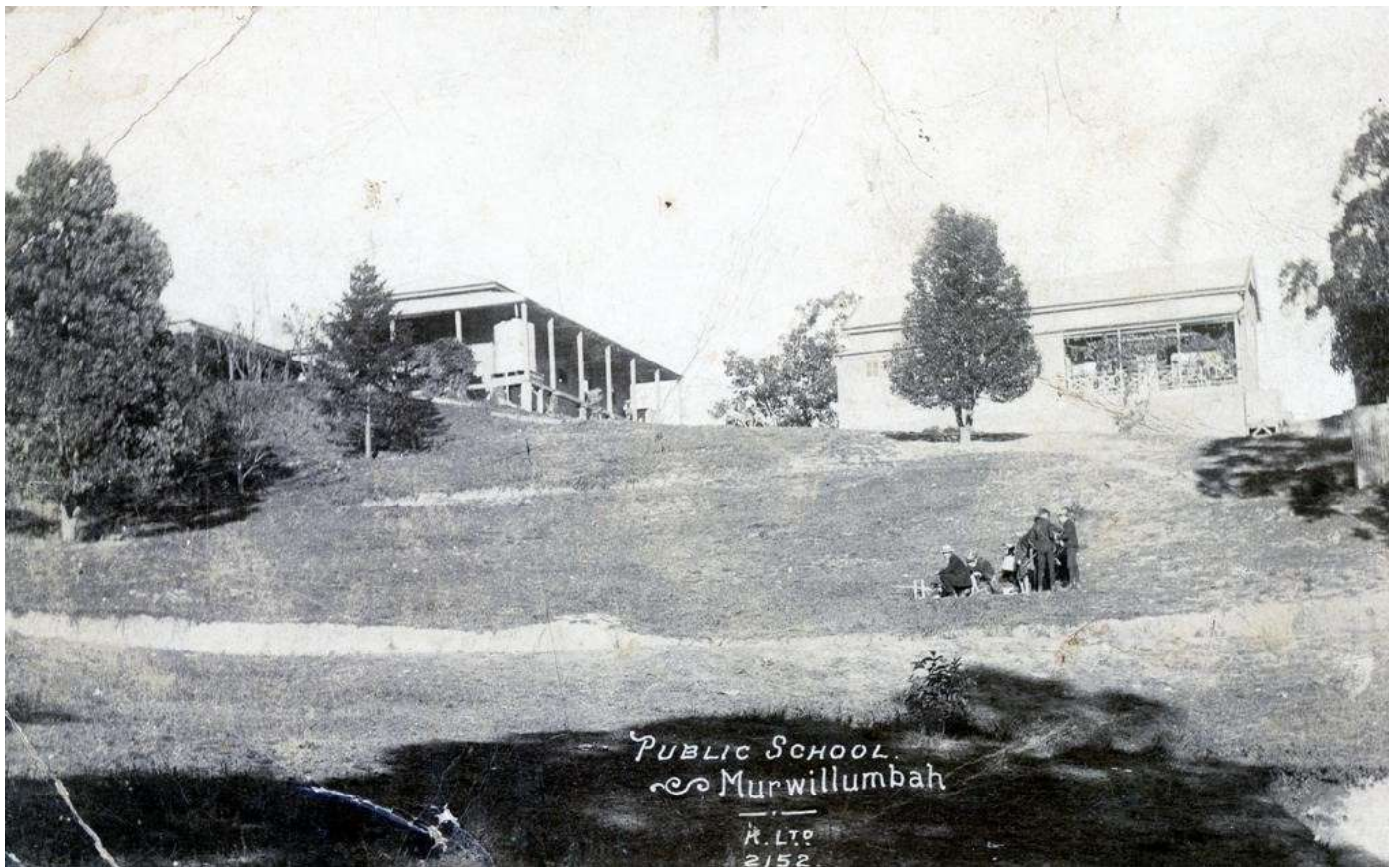
Murwillumbah Public School. 'An emergency hospitals was set up at Murwillumbah at the 'Cooking School' where 84 patients were treated with no deaths...'