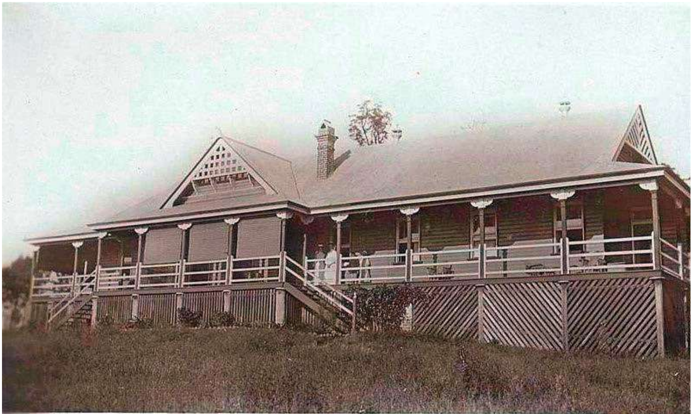
Tweed Cottage Hospital. 'The subsidised Country Hospital of the Tweed treated 138 patients of whom 8 died.'

The interval between the 'invasion' of influenza in late Feb and the proclamation of quarantine regulations three months later may be attributed to the nature of the first cases that caused concern in the district. They occurred at Fingal, also known as The Caves. On Thursday 27 Feb the Tweed Daily reported: 'Two suspicious cases of illness have occurred at the blacks' camp near Fingal, the children of half-caste parents, missionaries recently arrived from Kyogle, and reported as contact cases there.' The local response was to isolate the 'camp' and to 'take drastic steps' to achieve 'rigid quarantine' which included 'special constables at Tweed Heads to patrol ferry and river, passenger boats, private boats and vehicles' and stopping 'all colored people unless they can furnish proof that they are not contacts for nine days'. The situation was complicated by the fact that some of those ill refused medical treatment. According to the Tweed Daily this was because they 'inclined to rely largely on the doctrines of the Christian Scientist for a riddance of the disease'. Sadly, in one case death resulted.