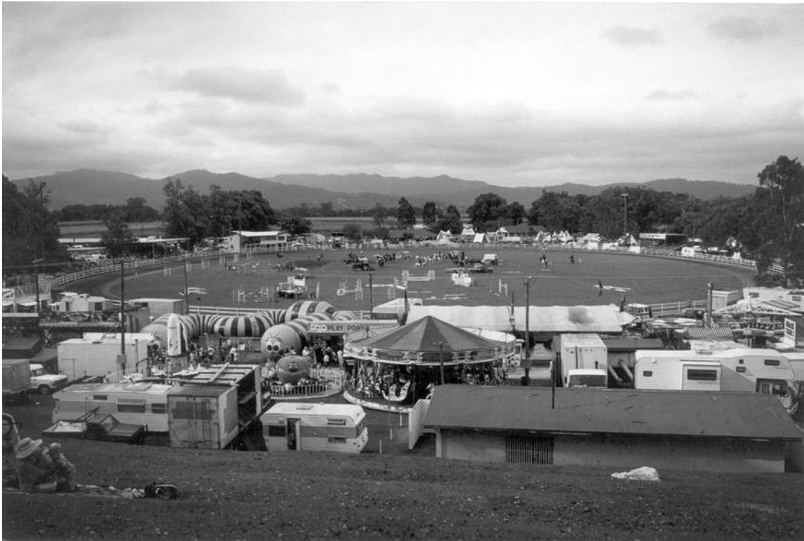
Murwillumbah Show Ground, pictured during an equestrian event at the annual show, was used as a track for greyhound racing in the 1930s. (Per Di Millar, Unknown photographer, approx. early 1960s)

straight sides provided a 500 yard course with an 80 yard finishing straight. Dress trial races drew large crowds and a crowd estimated at 2,000 attended the opening meeting of the Tweed Heads Coursing Club held on Tuesday night, 11 Aug 1936. The nine event programme was conducted without a hitch.