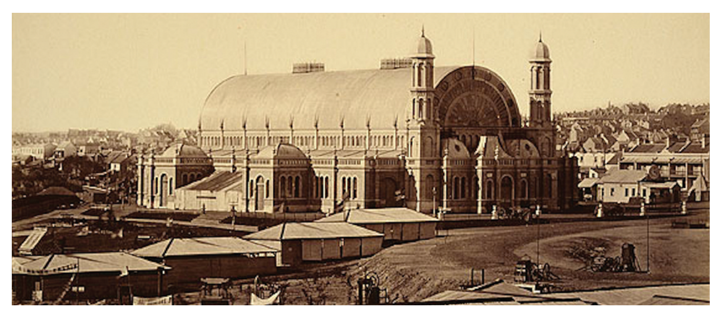
Exhibition Building, Prince Edward Park c1870

in the same year.<sup>7</sup> Today the Royal Easter Show is Australia's largest annual ticketed event, despite the 1919 Flu Pandemic, World War II and COVID, attracting interest from wide sections of the community, including the RAHS. During the 1980s and 1990s, our Society occasionally took a stall, where its publications and merchandise were on display.