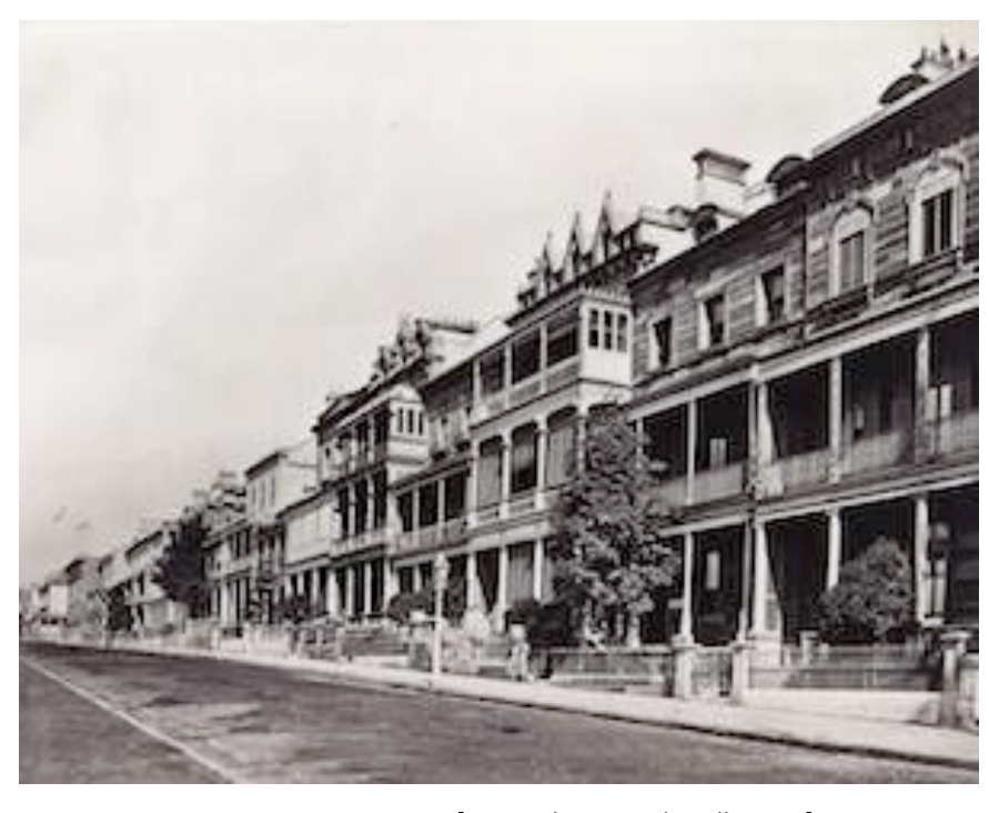
Macquarie Street 1880