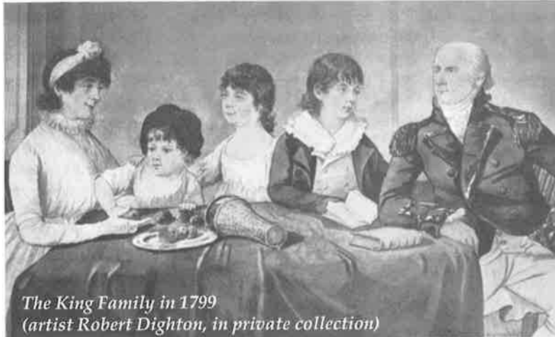
The King Family in 1799 (artist Robert Dighton, in private collection)

The second governor's wife to make Government House a real home was Elizabeth Macquarie. At the age of 31, Macquarie had married his first wife, Jane Jarvis, for love while on active service in India; his good luck was that she left him her considerable fortune, but she did not leave him a son and heir. At the deathbed of his distant cousin and her brother-in-law, Macquarie met Elizabeth Campbell. He described her in his diary as a practical woman, who would make 'an admirable soldier's wife'. He proposed, on condition she wait until he returned from his next tour of duty in India. And she did. They eventually married, in 1807; she was 29, he 46. His initial assessment proved correct.