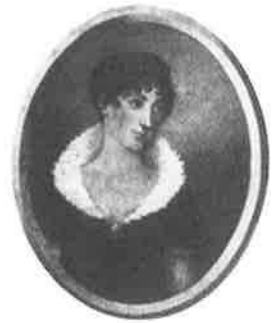
Mrs Elizabeth Macquarie (miniature by unknown artist)